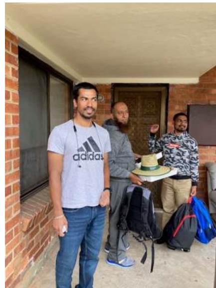
A new beginning

It is almost a year since the tennis champion Novak Djokovic was detained in the Park Hotel and then deported. Djokovic will reportedly be allowed to compete in the 2023 Australian Open with authorities about to overturn his three-year ban and grant him