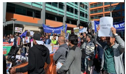
From The Guardian 12/8/2019

As for the carrot of getting children out of detention, there is still no law that prevents children being put in detention—so it can happen again. And indeed there are the two little girls from Biloela back on Christmas Island. There are many children in community detention—with no visas and no secure future. There are also thousands of children in situations in Australia with no family income, no security for the future. Indeed all that advocates feared in late 2014 has come to pass.