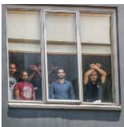
Men at the windows of the Mantra when nearly 200 people gathered outside to sing Christmas carols.

Sick refugees who were brought to Australia for medical help have instead been detained in two inner-city hotels for months on end, in some cases not getting the treatment they need. There are about eighty men in Brisbane (Kangaroo Point Central Hotel & Apartments) and fifty in Melbourne (Preston Mantra Bell City Hotel).