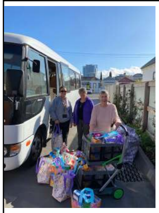
The Kilbreda bus full of goods!

Another, Melbourne based single mother of 2, set up her cottage industry to make masks for BASP, her daughters' school and others in the community. She has been dealing with serious health issues and she has found that this activity of being active and useful has given her a great lift.