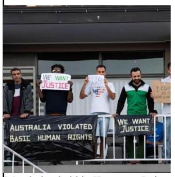
Men being held in Kangaroo Point Hotel in Brisbane.

We emailed those BASP supporters for whom we have email addresses the following message: